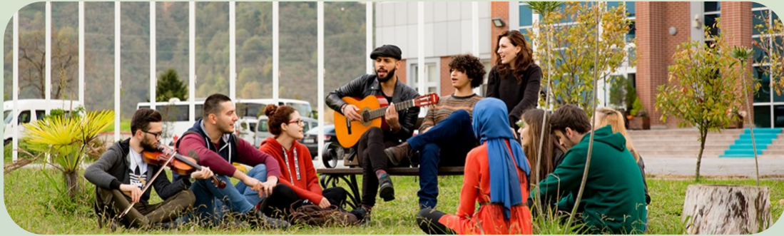
Students gathering and having fun on the campus.

University organises integration meetings and events for students once a month.