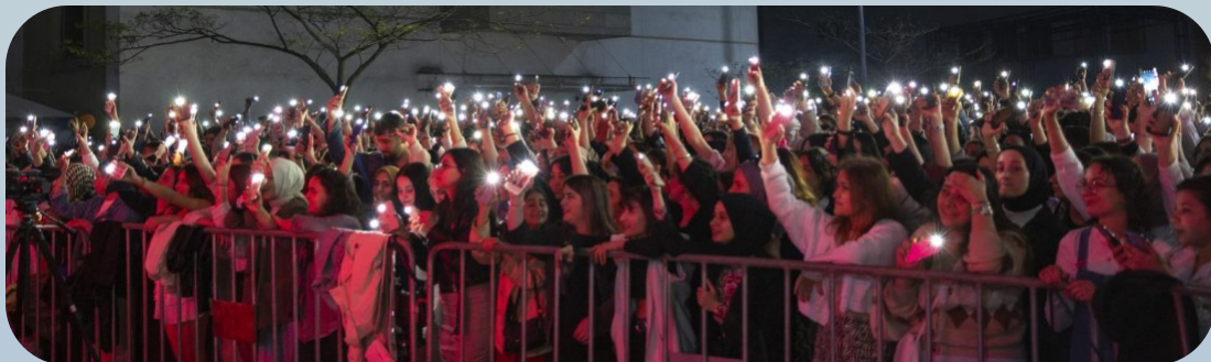
Traditional Spring Fest, audience (May, 2024)