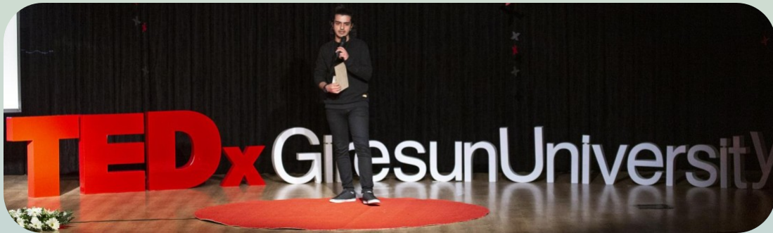
Theme: "Bildiğinden Fazlası" (More Than You Know), October, 2021