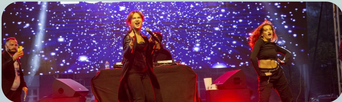
Traditional Spring Fest, dance performance (May, 2024)